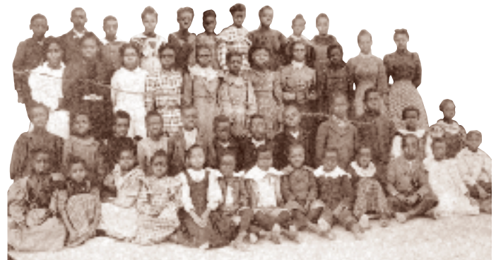
Students from "Ebenezer School No. 2, Colored" in Centerville. Early 20th-century.