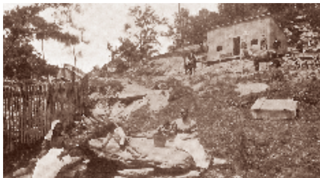
A brief respite at Braddock's Spring (c. 1903) Braddock Heights, Maryland

Welcome to the City of Frederick and Frederick County! This guide provides glimpses of more than two centuries of African American heritage in our area and presents a new opportunity to experience the past. Feel the heat of smelters at Catoctin Furnace, where expert African metalworkers helped build our nation by forging an array of ironworks, including cannonballs used to win American independence. Marvel at the skill, dedication and compassion of those slaves, free persons, and “contraband” who helped heal the thousands of Civil War wounded in Frederick after the conflicts at South Mountain, Monocacy, Antietam and Gettysburg. Imagine the daily bustle of segregated businesses on All Saints Street. Hear the strains of jazz tunes and harmonies of gospel hymns rising from churches and social halls all over the county, and be inspired by the faith and fortitude of our African American forebears.