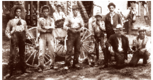
Late 19th-century street scene in New Market on the Old National Pike

Other traces of Black enclaves exist with structures and cemeteries throughout the county. These can be found in places such as New Market, Mt. Airy and Libertytown in eastern Frederick County, Fountain Mills and Mt. Ephraim in the southeastern reaches of the county, Point of Rocks, Brunswick, Jefferson and Burkittsville to the southwest. Middletown has a Black cemetery and was home to a hamlet named Spoolsville. Black populations were not as prevalent in northern Frederick County which generally had been settled by German immigrants who rarely practiced slavery. Anomalies included Catoctin Furnace, Lewistown and most notably Emmitsburg, due to its settlement by early English and Scotch Irish immigrants.