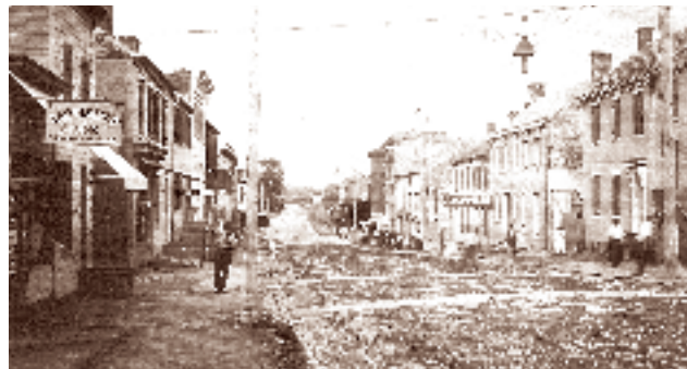
A view looking east on All Saints Street (c. 1903).